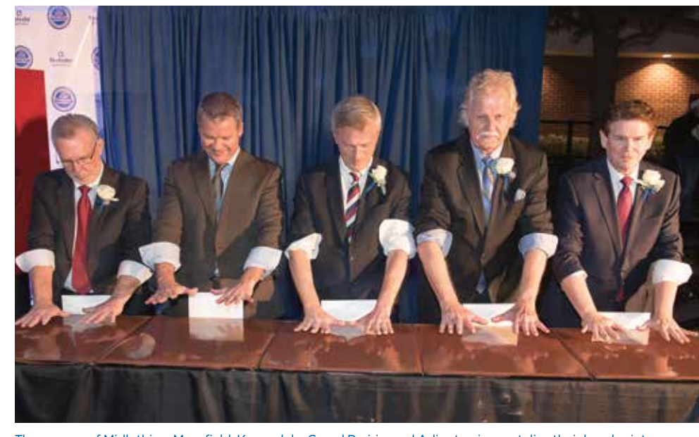
The mayors of Midlothian, Mansfield, Kennedale, Grand Prairie, and Arlington immortalize their hand prints in concrete to celebrate the 10th anniversary of Methodist Mansfield. In the past decade, we have treated more than 772,000 patients — 438,000 in the emergency department — and delivered 15,000 babies.